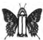
Athens Area Chrysalis